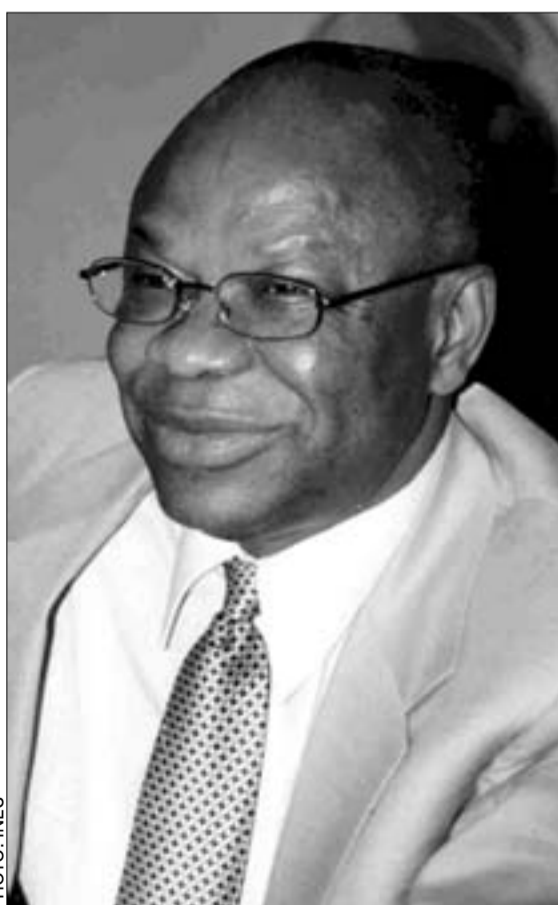
MAURICE IWU, INEC chairman, is a former professor at the University of Nigeria, Nsukka.

The third key issue was that we embarked on reform. We were able to in-