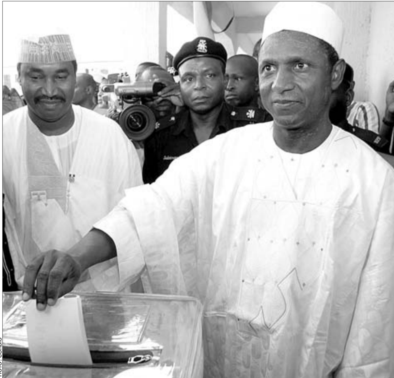
Umaru Yar'Adua casts his vote in the election that made him President of Nigeria and produced landslide victories for the PDP in the federal and state elections.

of President Olusegun Obasanjo, was declared the easy winner of the presidential race. The PDP also won overwhelming majorities in the upper and lower houses of the bicameral National Assembly, and 28 of the 36 state governorship contests.