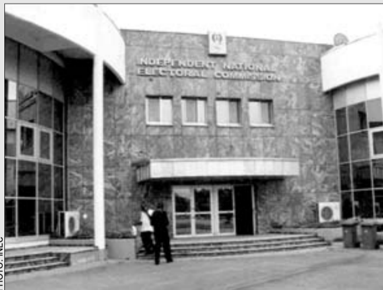
The Independent National Electoral Commission, a permanent body that was established in 1998.

The Commission intends to change the arrangement whereby electoral materials are produced abroad. This limits the freedom to adapt promptly to any sudden demand for adjustment, as was the case following