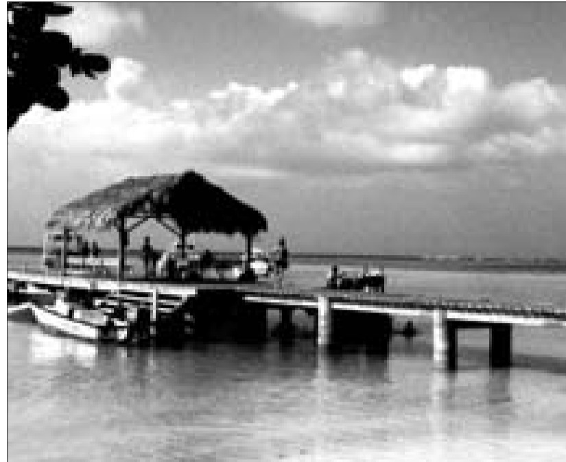
No mass tourism here: the island of Tobago is clean, green, safe, and serene.

Together, the two islands attract approximately 460,000 tourists a year. Most are from Europe—principally the U.K. and Germany—and North America. But an increasing number come from within the Caribbean region itself, and cruise ship arrivals are also rising: trends the authorities are eager to encourage.