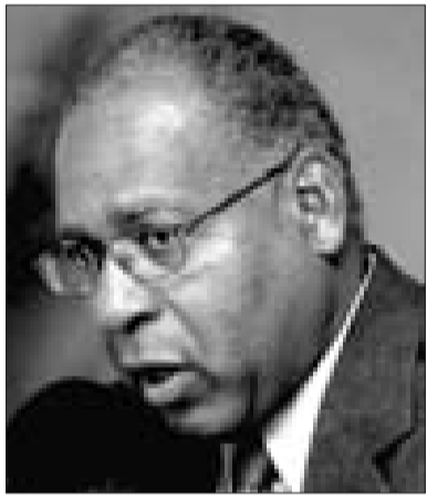
PATRICK MANNING Prime Minister

He emphasizes T&T's commitment to helping fellow Caricom states meet the economic challenges caused by rising energy costs. Last year, with oil prices spiraling upwards, the government established a petroleum stabilization fund to provide assistance of TT$300 million (US$48 million) to Caricom countries.